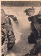
ATHABASCA FALLS Lake Louise-Jasper Highway