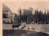
Deer feeding on Banff Springs Golf Course