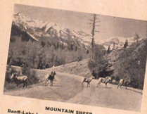
MOUNTAIN SHEEP Banff-Lake Louise Highway, Banff National Park