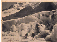
Columbia Ice Fields—Lake Louise-Jasper Highway

INDIANS - OLD TIMERS - LIVE STOCK EXHIBITS - INDUSTRIAL EXHIBITS