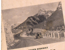
PAVED HIGHWAY Calgary to Banff National Park