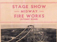
Peace River Bridge, on the Alaska Highway