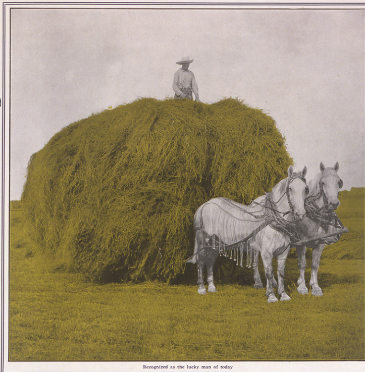
Recognized as the lucky man of today

A Different Battalion for Each Programme