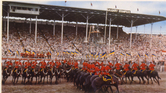
Royal Canadian Mounted Police Musical Ride...every afternoon performance