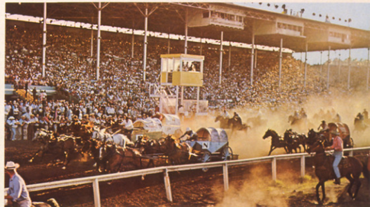
World Famous Chuckwagon Races - 8 Races each evening performance

THE GREATEST OUTDOOR SHOW ON EARTH CALGARY ALBERTA CANADA