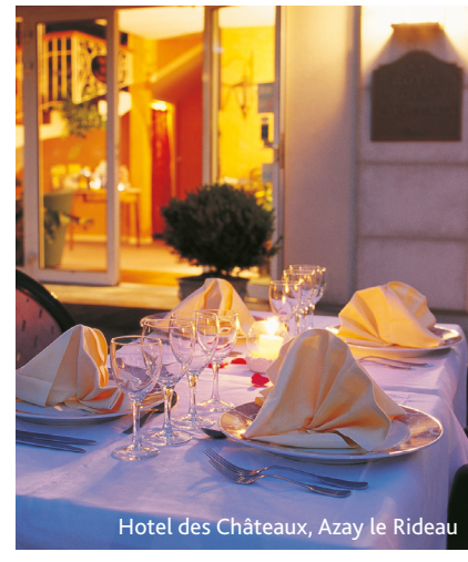
Choose from the 3-course Menu 3 Plats at Hotel des Châteaux

Langeais - (10k, just across the Loire) has yet another château, this one is particularly well restored with a fully working drawbridge, immaculately kept gardens and is floodlit at night.