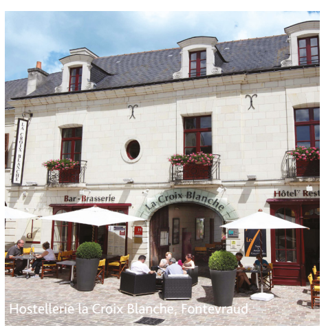
Choose from the 3 course Menu du Chef at Hostellerie la Croix Blanche

Approx 40 mins from Azay le Rideau. 27 miles / 43k