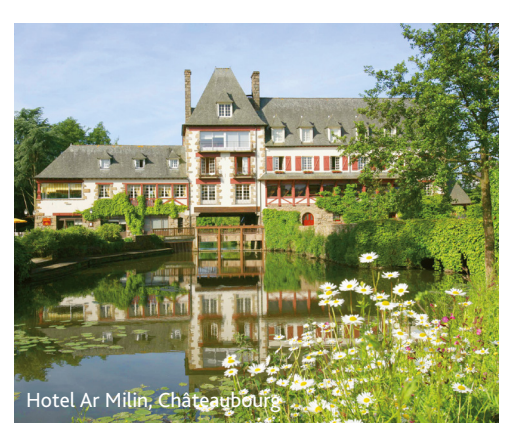
Choose from the 3 course Menu de Saison at Hotel Ar Milin

Rennes - (21k) a university city and the capital of