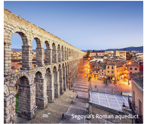
Segovia's Roman aqueduct

This city has some outstanding monuments and has been strategically important since Roman times when the famous two-tiered aqueduct was built - this is still in operation and one of the finest examples in existence. Places to visit include Riofrío (11k) and its Palacio de Caza, La Granja de San