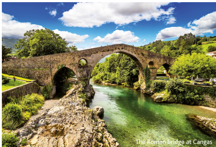
The Roman bridge at Cangas

Arriondas (5k from Cangas) is the starting point for many white water sports on the Rio Sella. The annual kayak festival is held here at the beginning of August with participants from all over the world. Covadonga (14k from Cangas), the birthplace of the reconquest of Spain from the Moors has an impressive monastery and the shrine of La Santina - the patron saint of Asturias, is in a nearby cave. Cangas is a lively town with an ancient bridge and a good choice of shops, bars and restaurants.