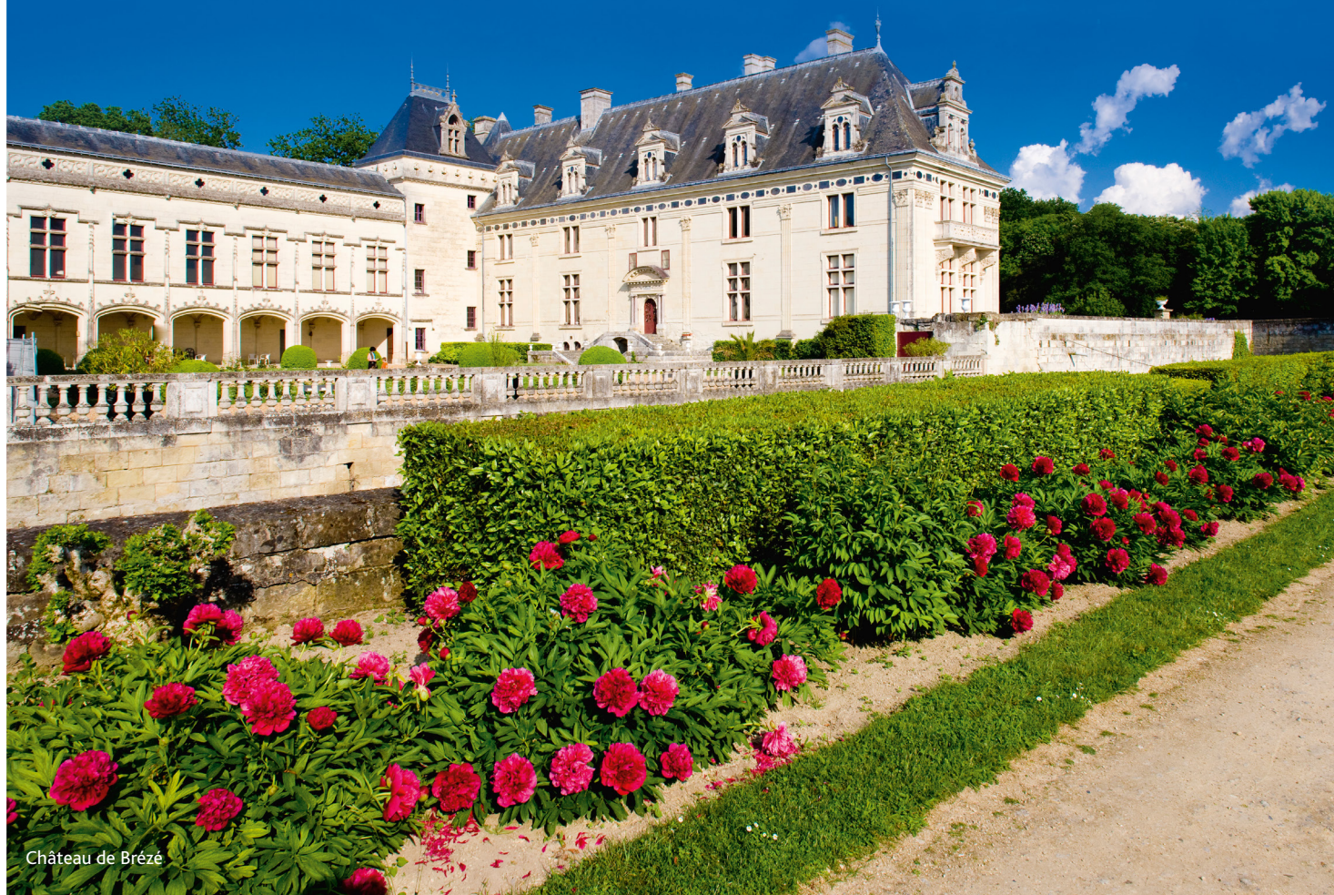
Château de Brézé