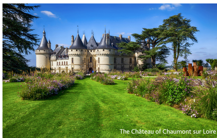
The Château of Chaumont sur Loire

Chaumont sur Loire - a 20 minute drive from Chitenay, has one of the largest and most stunning of the Loire châteaux. Originally built over 1000 years ago, it was razed to the ground in 1465 and then rebuilt within a few years on the same site alongside the Loire and lavishly furnished in Renaissance style. The landscaped grounds are also fabulous and the International Garden Festival is held here annually from April to early November, when artists from all over the world create some amazing themed gardens.