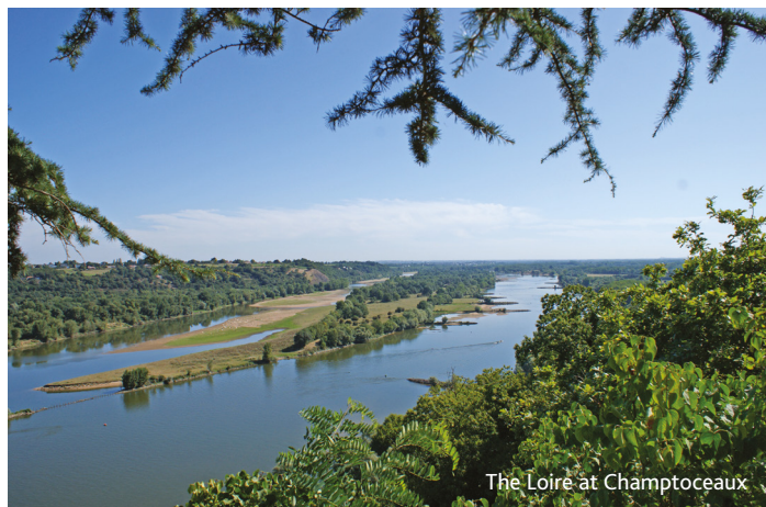
The Loire at Champtoceaux

If you would like to spend some time in Nantes, it's only a 40 minute drive from here. As well as some modern architecture it's a very attractive place with historic riverside buildings and cobbled streets in the old city which is good to explore on foot. It's also the capital of crisp dry white Muscadet wines produced locally which are a great accompaniment to seafood.