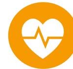
Social Services and Healthcare