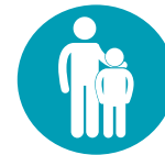
Social Services Children and Young People