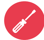
Hardware and System Support