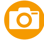
Creative and Digital Media