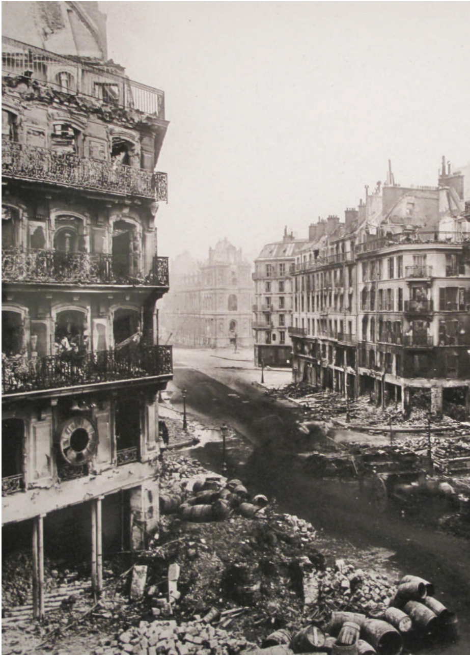
The rue de Rivoli after the fights and the fires of the Paris Commune

Benjamin thought the poet with the most immediate affinities with Blanqui was Baudelaire. The conspiratorial cells that Blanqui operated in, according to Benjamin, were closer to the bohemia of Baudelaire, closer to poets and criminal weirdos than to the organised working class. A more accurate affinity, however, would be with Rimbaud, who more than any other could be called the poet of the Commune. Rimbaud's 'logical derangement of all the senses' is a theorisation of the convulsions in collective subjectivity set off by the experience of the Commune. The senses are not the privatised senses of the official world, Bohemian or otherwise, but a collectivity that runs outward into a revolutionary sensory system that itself reaches backwards and forwards into time, upending capitalist temporality. The young Marx, famously, wrote that 'the forming of the five senses is a labour of the entire history of the world down to the present', and so, for Rimbaud, the task of poetic labour is to suggest methods to bring about the derangement of the 'entire history of the world'.